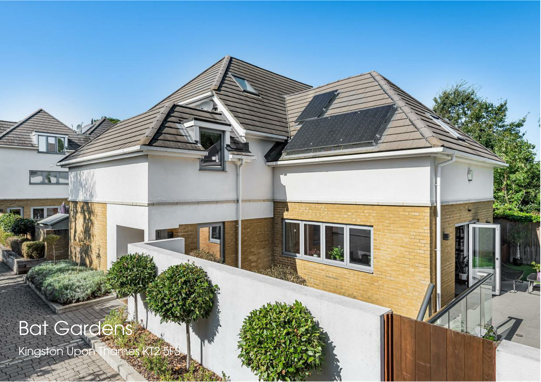
Bat Gardens Kingston Upon Thames KT2 5FS